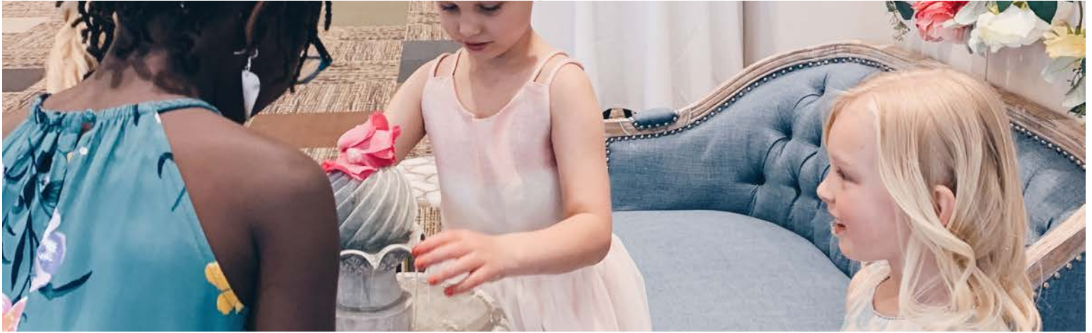
2019 DADDY DAUGHTER DANCE

Prevention efforts occur first and foremost through prayer. Prayer is an effective way to defeat exploitation, a modern-day slavery. Action169 hosts prayer calls and mobilizes national and international prayer initiatives to eradicate a spiritually-oppressive injustice. While prayer and awareness are essential, it is not enough without taking social action.