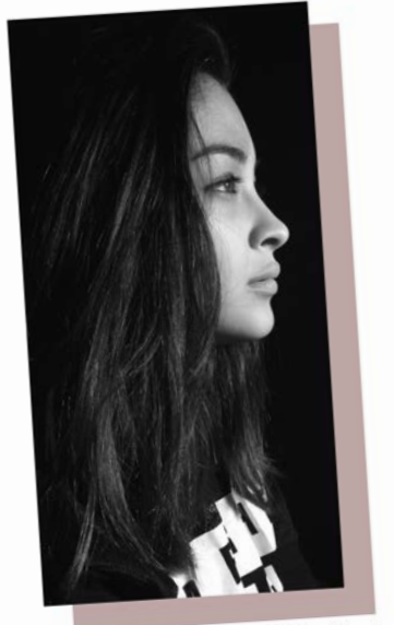
Overcomer of exploitation who participated in a restoration group | *Name Changed