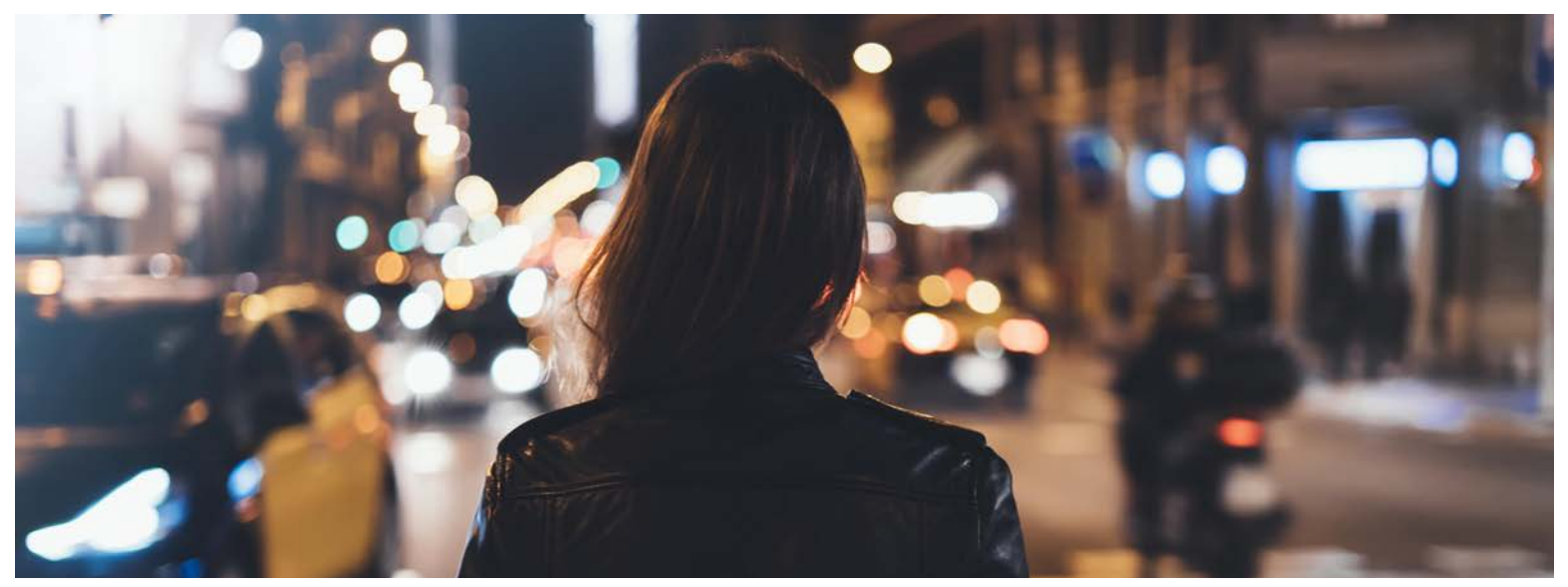
LOVE SUPPORT EMPOWER