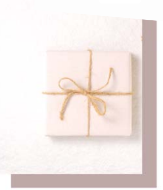
Strip Club Outreach | *Name Changed