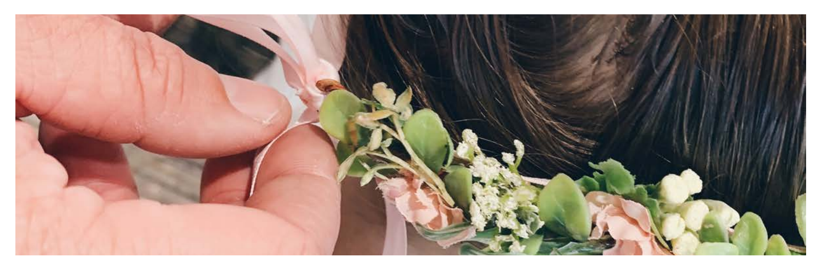
2019 DADDY DAUGHTER DANCE

Prevention efforts occur first and foremost through prayer. Prayer is a powerful and effective way to defeat exploitation, a modern-day slavery. Action169 hosts prayer calls and mobilizes national and international prayer initiatives to eradicate a spiritually oppressive injustice.